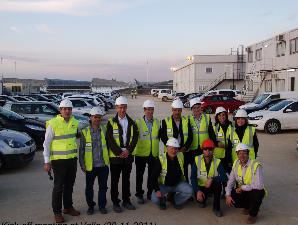
Kick-off meeting at Vello (30-11-2011)