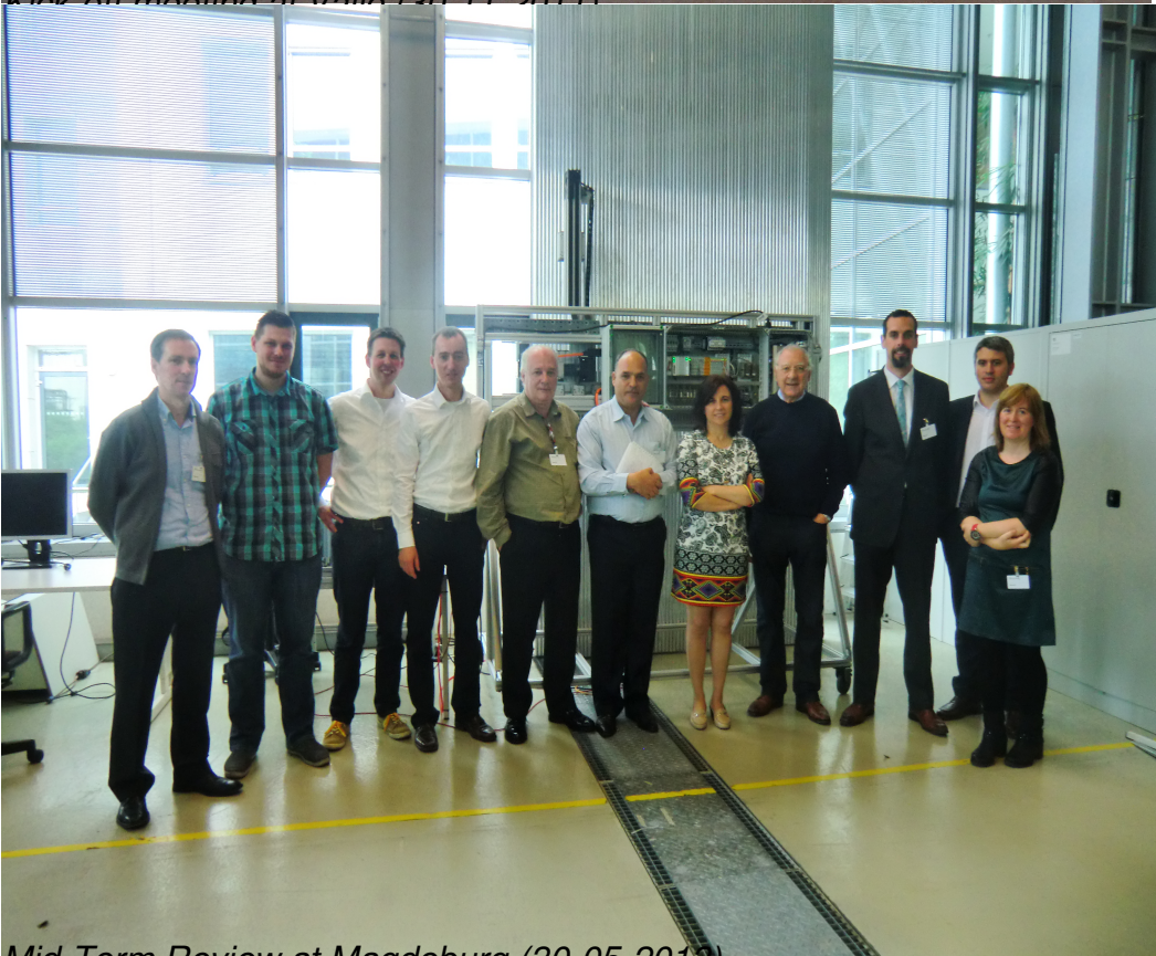
Mid-Term Review at Magdeburg (30-05-2013)